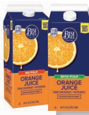
Assorted Varieties Best Yet Orange Juice