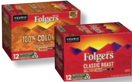
Assorted Varieties Folger's K-Cup Coffee 12 Count.