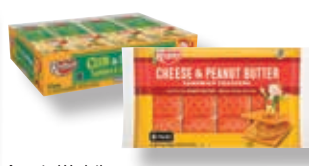
Assorted Varieties Keebler Cracker Sandwiches 11.04 oz.