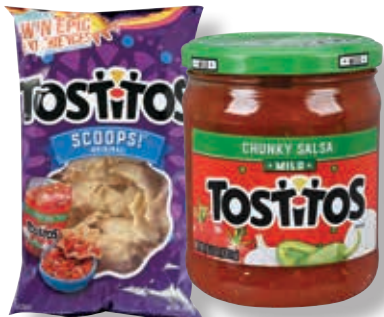
All Varieties Tostitos Tortilla Chips Or Salsa