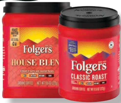
Assorted Varieties Folger's Ground Can Coffee 9.6 oz.