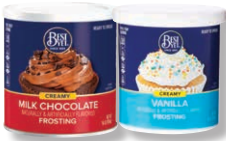
Assorted Varieties Best Yet Frosting 16 oz.