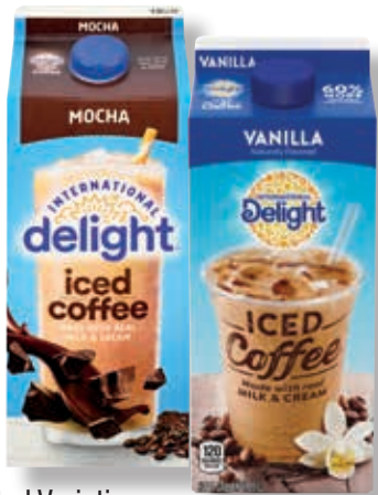
Assorted Varieties International Delight Iced Coffee