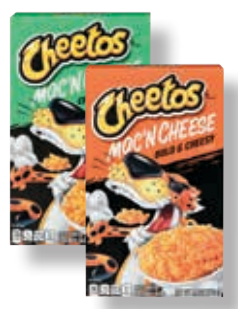
Assorted Varieties Cheetos Macaroni & Cheese 5.6-5.9 oz.