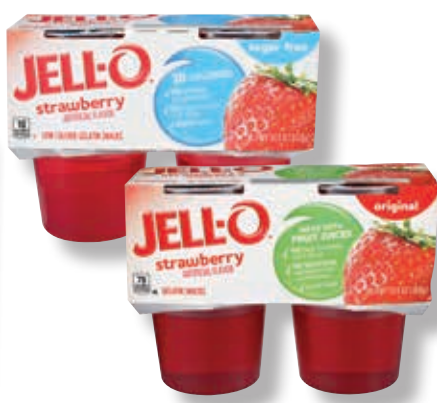
Assorted Varieties Jello Gelatin Or Pudding