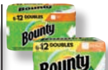
Bounty Paper Towels 6 Roll.