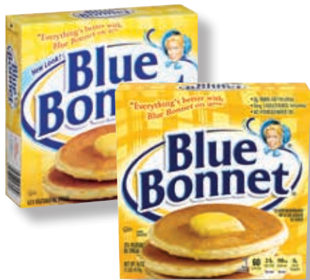
Blue Bonnet Spreads