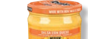
Frito Lay Dips 15 oz.