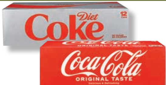
Coca Cola, Diet Coke and all Coke family 12 Pack