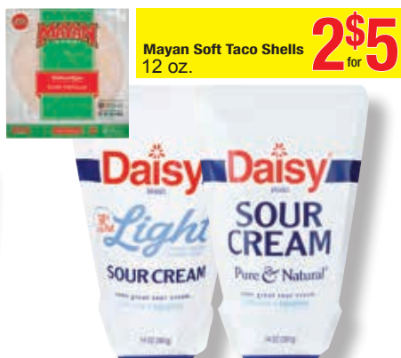
Assorted Varieties Daisy Sour Cream