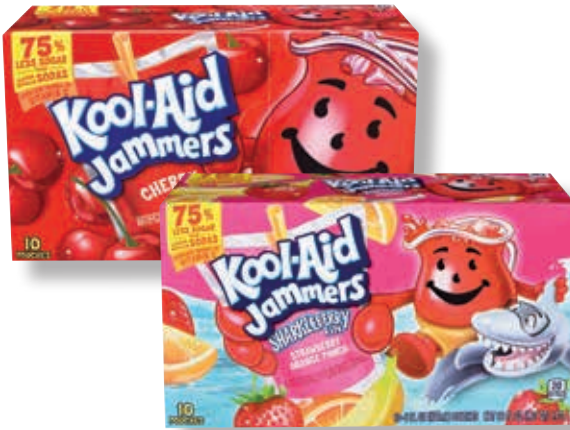
Assorted Varieties Kool-Aid Jammers 10 Pack.