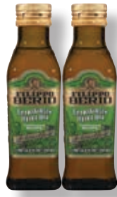
Assorted Varieties Filippo Berio Extra Olive Oil 8.4 oz.