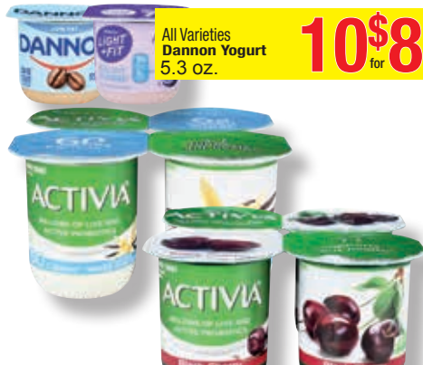
Assorted Varieties Dannon Activia Yogurt