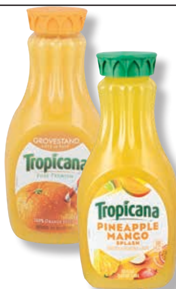
Assorted Varieties Tropicana Premium Orange Juice