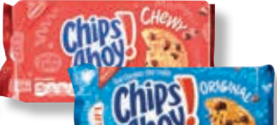
Assorted Varieties Nabisco Chips Ahoy! Cookies 7-13 oz.