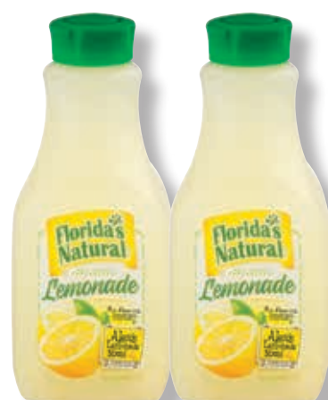
Assorted Varieties Florida's Natural Juices