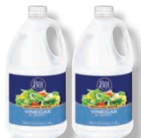
Best Yet White Vinegar 128 oz.