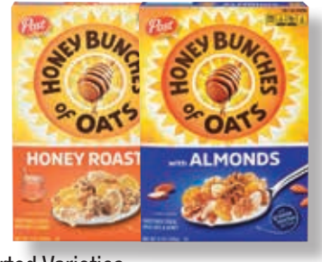
Assorted Varieties Honey Bunches Of Oats Cereals 11-12 oz.