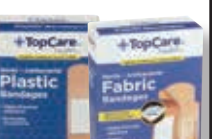
TC Bandages 1-60 Count.