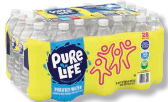
Pure Life 28 Pack Water Plus Deposit.