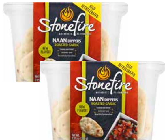
Original Or Everything Stonefire Nan Dippers