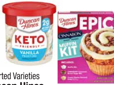
Assorted Varieties Duncan Hines Muffin Kits Or Frosting 11-32.34 oz.