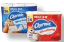
Charmin Ultra Soft Or Strong Bath Tissue 9 Roll.