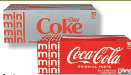
Coca Cola, Diet Coke and all Coke family 10 Pack