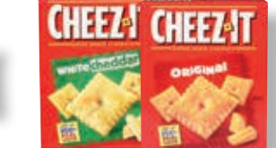
Original Or White Cheddar Cheez-It Crackers 7 oz.