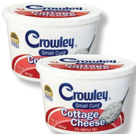
Assorted Varieties Crowley Cottage Cheese