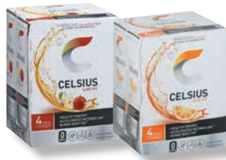
All Varieties Celsius 4 Pack