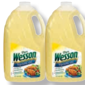
Assorted Varieties Wesson Vegetable Oil 128 oz.