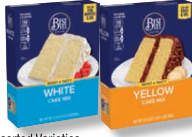
Assorted Varieties Best Yet Cake Mixes 16.5 oz.