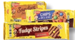
Assorted Varieties Keebler Cookies 8.5-12.5 oz.

FRESHNESS YOU CAN DEPEND ON! Check our code dates. If you find an item past it's expiration, we'll give you a $1.00 certificate!