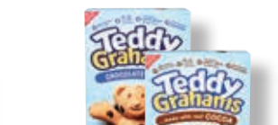
Assorted Varieties Nabisco Teddy Grahams 10 oz.