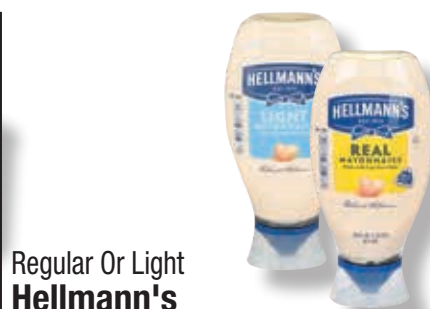
Regular Or Light Hellmann's Squeeze Mayonnaise 20 oz.