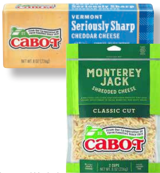
Assorted Varieties Cabot Shredded Or Bar Cheese