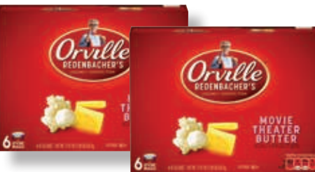
Assorted Varieties Orville Redenbacher's Popcorn 6 Pack