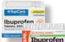
TC Pain Relief Tablets, 200 50 Count