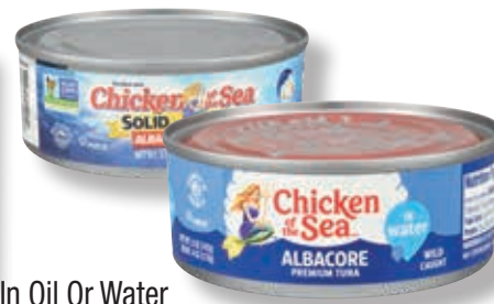
In Oil Or Water Chicken Of The Sea Albacore Tuna 5 oz.